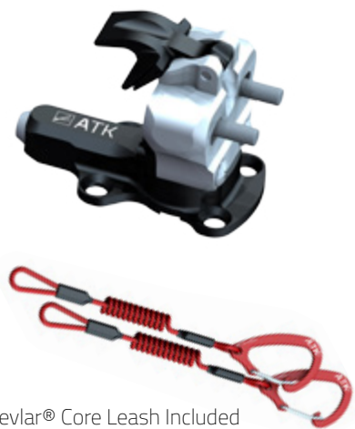
Kevlar® Core Leash Included